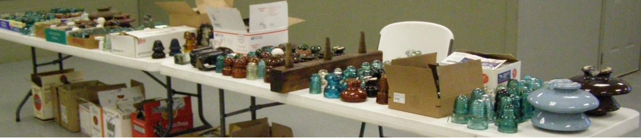
Two tables of auction lots from Rick Soller.